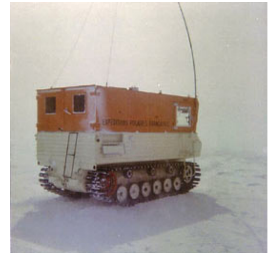
One of the French traverse vehicles