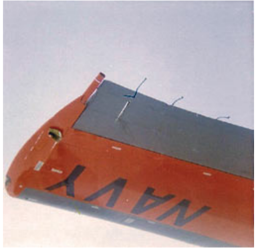
A view of damage to the left wing