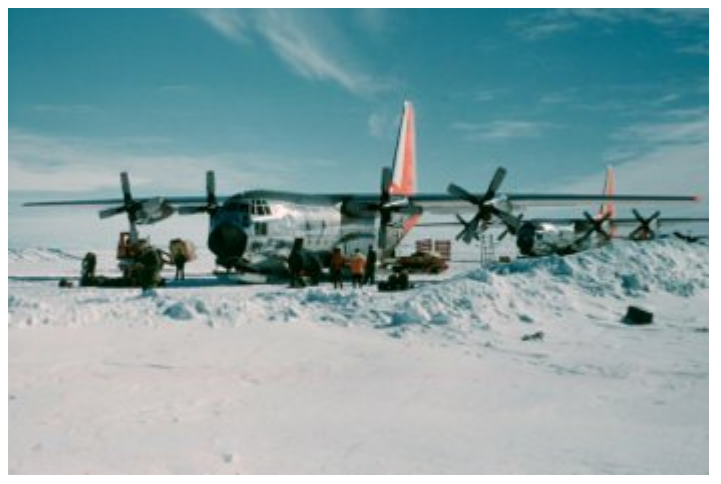
VX-6's LC-130 aircraft first made it to the ice (and to Pole) in the 1960-61 season. Juliet Delta 321 was the first of these to arrive. This photo shows 321 in front of 319 on the ice runway in November 1960.

the crash 1/72 digging out 3/87 the 321 module 3/87 crash of 131 3/88 successful flight 6/88